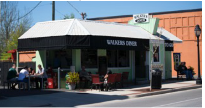
Walker's Diner on N Main Street.

The atmosphere was pleasant for a diner. I enjoyed the cleanliness of the counter, floors, and stools. I enjoyed the overall experience which overcame the food. The wrap was good; however, I would advise anyone reading this to stick to the burgers and shakes. I liked that the menu had a variety of things ranging from the specials of fish to kettle corn dogs. For my last review of my career I am glad that I chose to eat at Walker's Diner. I give them 4 of 5 stars for the overall atmosphere, food, and staff.