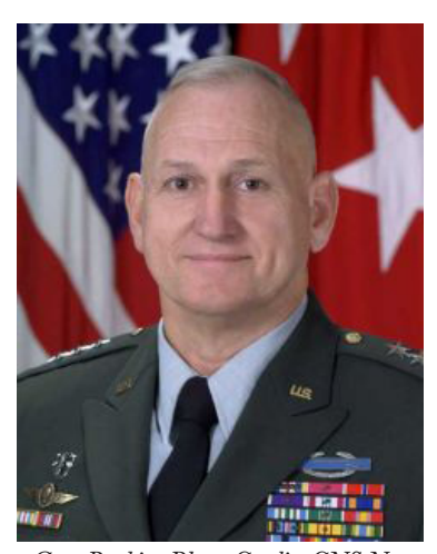
Gen. Boykin.